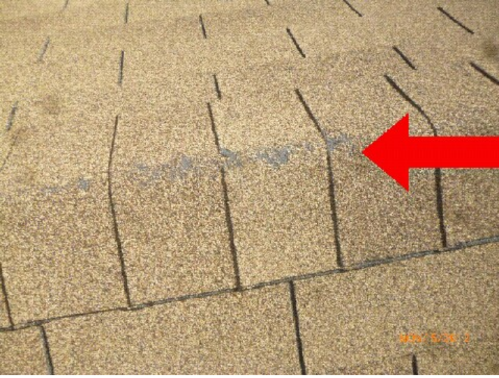
deterioration noted on roof